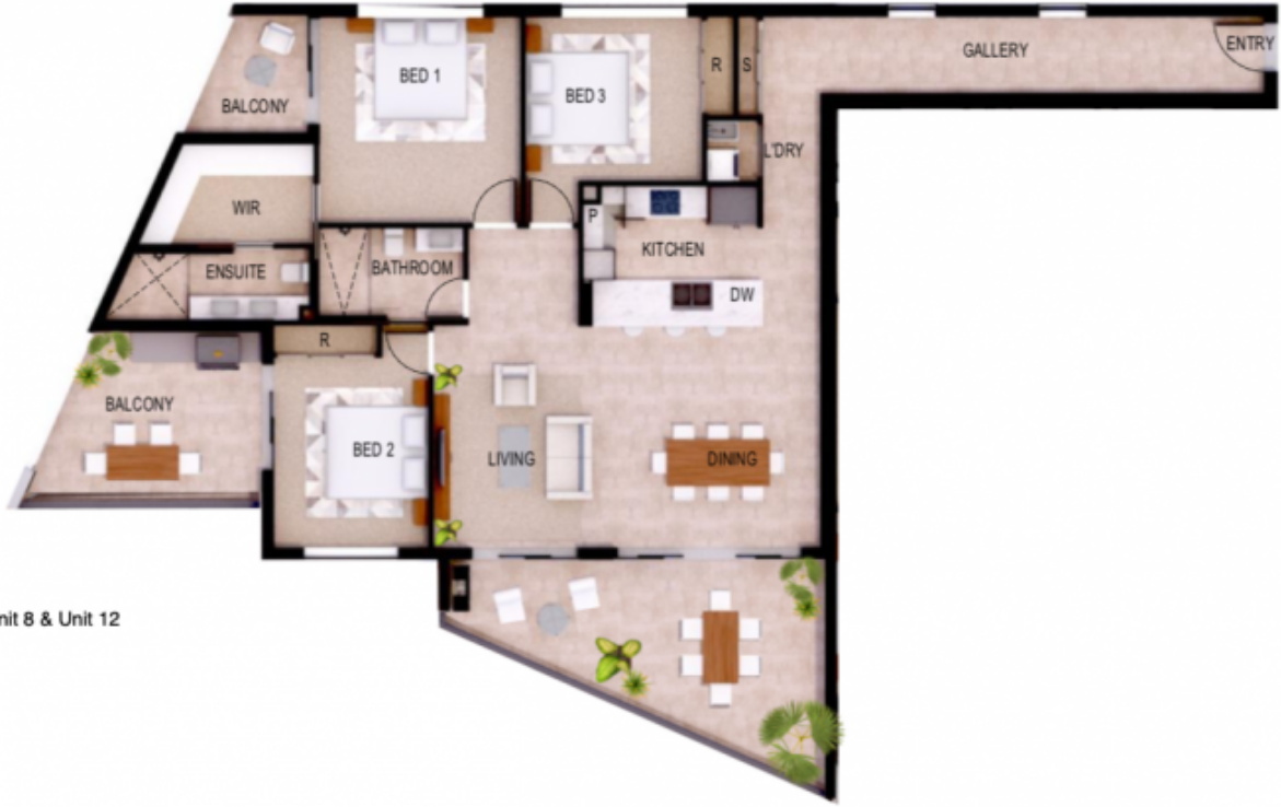
Unit 8 & Unit 12