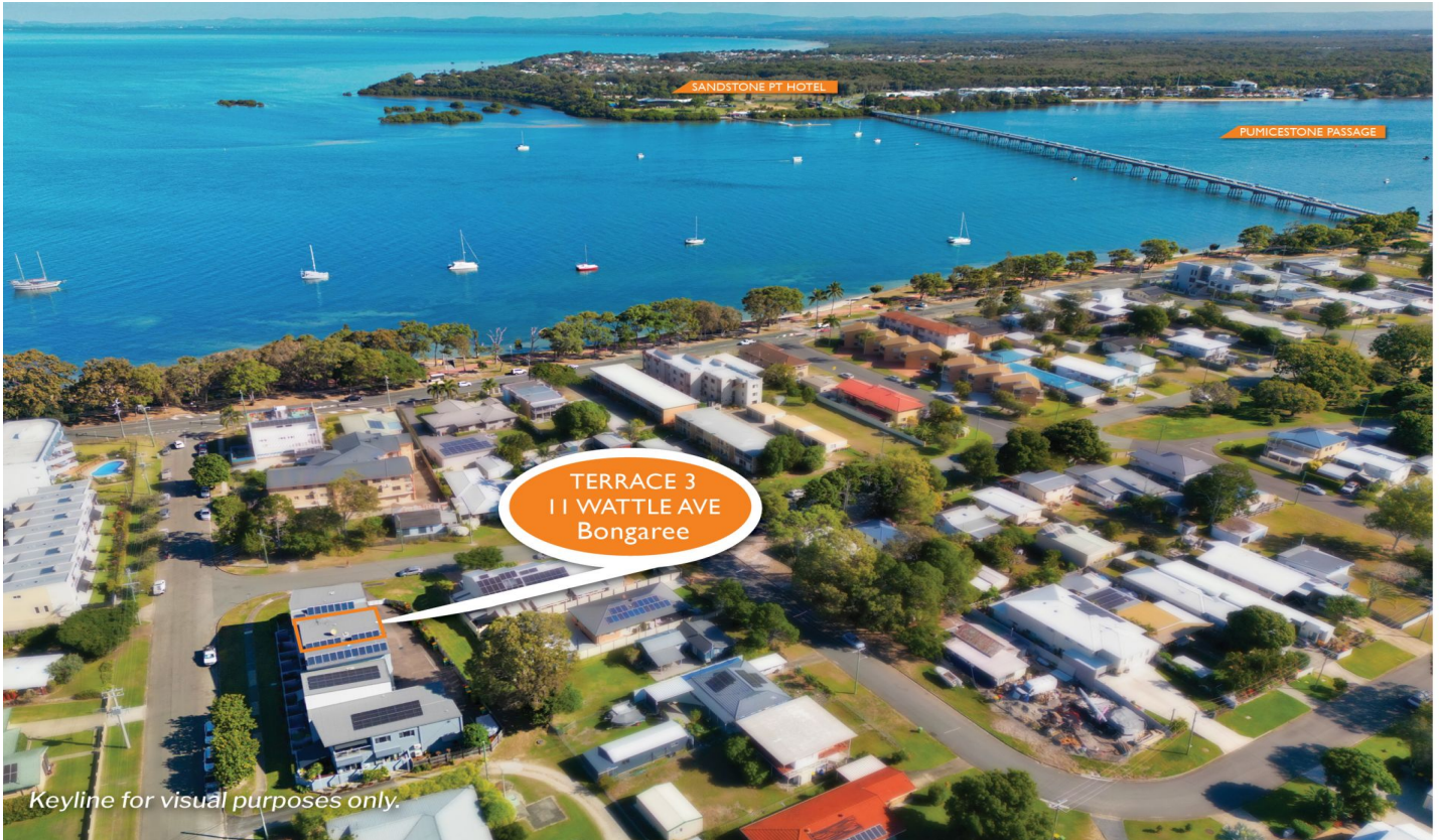
Keyline for visual purposes only.